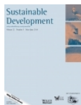
Sustainable Development (Wiley)

Special issues are foreseen as an output of the conference in the following leading indexed peer-reviewed journals: