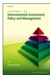
Journal of Environmental Assessment Policy and Management (World Scientific)